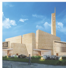
MASJID E AMINA (SECTOR M)