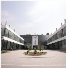
VILLAS SHOPPING ARCADE