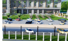
DHA COMMUNITY CLUB