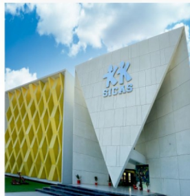
SALAMAT INTERNATIONAL CAMPUS FOR ADVANCE STUDIES (SICAS)