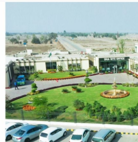
DHA SITE OFFICE