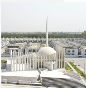
BILAL MOSQUE (VILLAS)