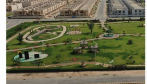
VILLAS COMMUNITY PARK