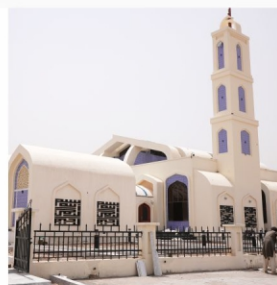
MASJID REHMAT UL ALAMEEN (SECTOR R)