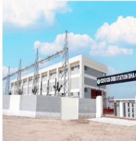
DHA GRID STATION (132KV)