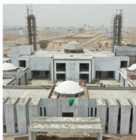
MASJID QUBA (SECTOR Q)