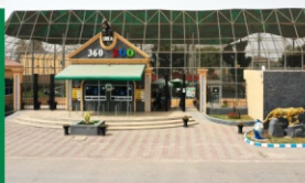
DHA 360° ZOO